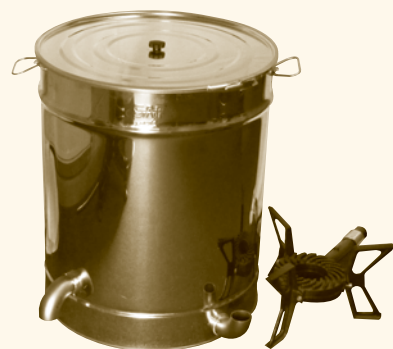
Gas Steam Wax Extractor