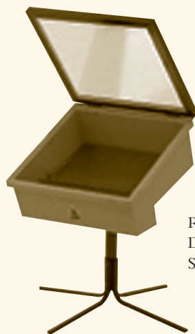
Rotating Double Glazed Solar Wax Extractor