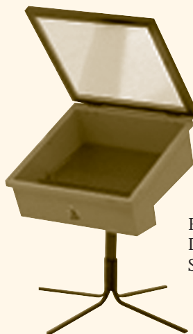
Rotating Double Glazed Solar Wax Extractor