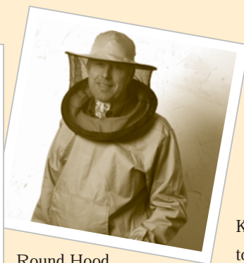
Round Hood (Deluxe)